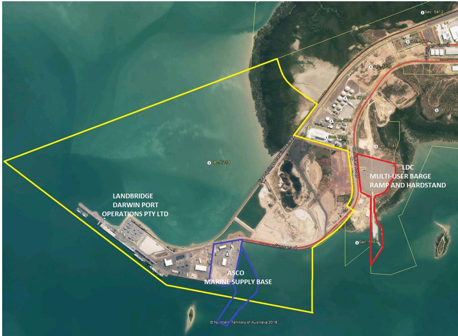
FIGURE 1 - LOCATION